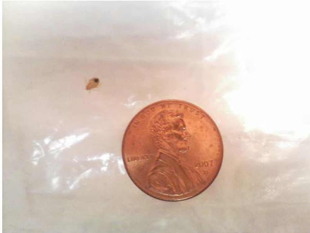
Bed Bugs: Photo by nobugsonme on August 7, 2007