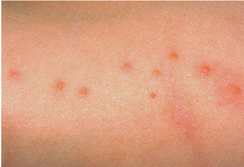
Photo of bedbug bites.