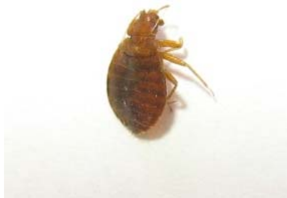
Bed Bugs: Photo by nobugsonme on August 7, 2007