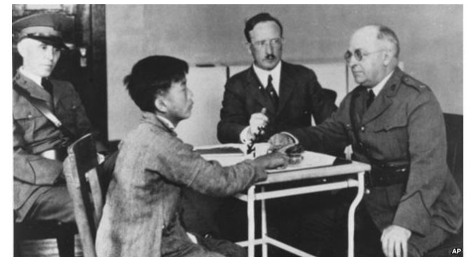
A Chinese immigrant is interrogated at a detention center on Angel Island in San Francisco Bay, Calif., in the 1920's.